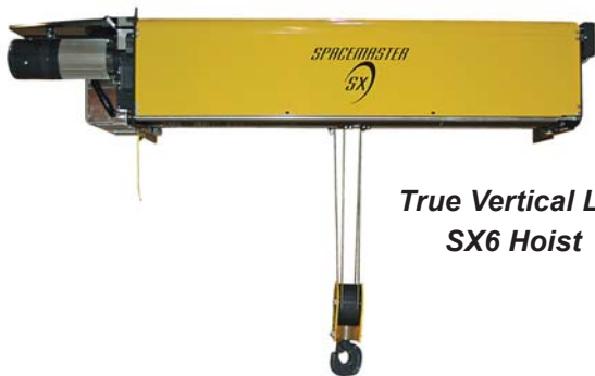
True Vertical Lift SX6 Hoist

The trolley drive is totally enclosed, grease lubricated and is designed to be maintenance-free. Trolley wheel bearings are permanently lubricated. The automatic disc brake and inverter control help extend the life of the motor and other components, which means less maintenance, less downtime, lower repair costs — and reduced cost over the lifetime of your hoist equipment.